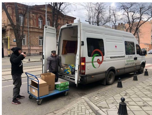
Humanitarian cargo in Odessa

Also, activities of many partner organizations are refocused to provision of humanitarian aid. Upon APH's agreement, mobile laboratories are used to deliver humanitarian goods; also, redistributed funds are used to procure humanitarian goods. Partner organization "Social Initiative for Occupational Safety and Health", thanks to APH's flexible response and change of intended use of available funds to humanitarian targets, has collected