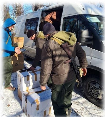
Preparation to transporting a humanitarian cargo by a mobile laboratory of the APH

The APH has decided to provide its mobile ambulatories for humanitarian needs, incl. evacuation of vulnerable populations, women and children, and delivery of foods and medicines. They work around the clock, delivering humanitarian cargoes from Western Ukraine to Kyiv and Eastern Ukraine.