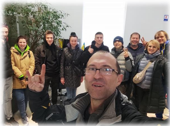
Alliance Humanitarian Patrol Team

Altogether, humanitarian convoy Kyiv-Lviv-Kyiv has taken three trips (7 trucks, approximately 42 tons of cargo), and there has been three Kyiv-Lutsk-Kyiv trips (3 trucks, approximately 18 tons of cargo). Humanitarian goods are delivered to a warehouse in Kyiv to be further distributed to NGOs, TDF units, hospitals, etc. Separately, drugs and humanitarian goods are delivered to Brovary (Central Rayon Hospital), Kozelets and other hotspots near Chernihiv.