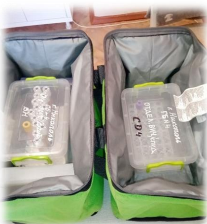
Transportation of CD4 blood specimens, Dnipropetrovsk oblast

social workers deliver tests and ART medications. In Dnipropetrovsk oblast, ART drugs are still, to some extent, sent to patients by mail. Besides, blood specimens for VS, CD4, etc. testing are transported.