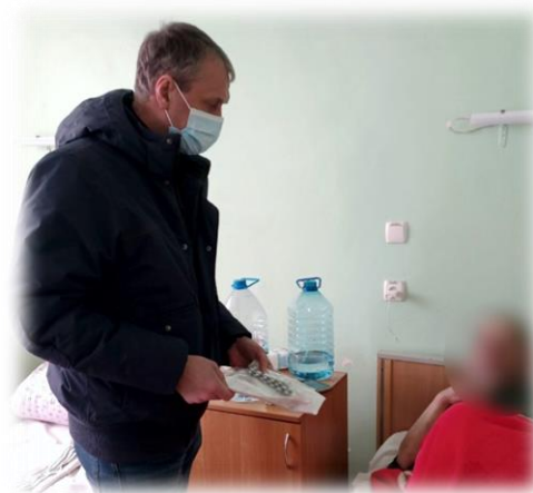
Delivery of ART medicines, Dnipropetrovsk oblast