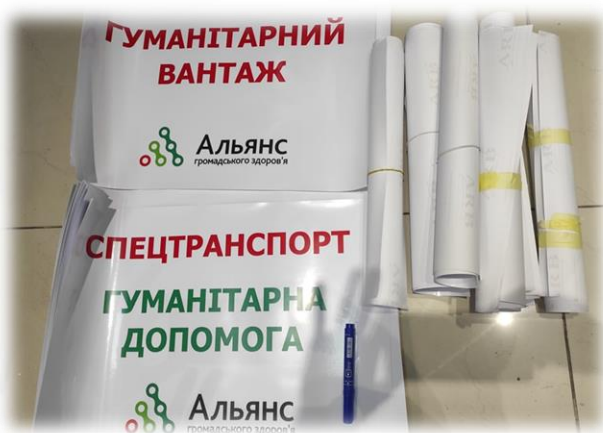
Now our mobile clinics will have special stickers