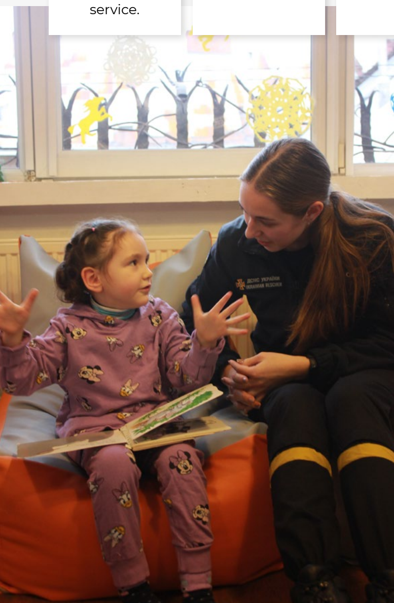
Photo: Psychologists of the State Emergency Service regularly Conduct classes in the Alliance supported shelter in Lviv

31 community initiatives were supported by mini-grants aimed at providing assistance to 15,284 children from different regions.