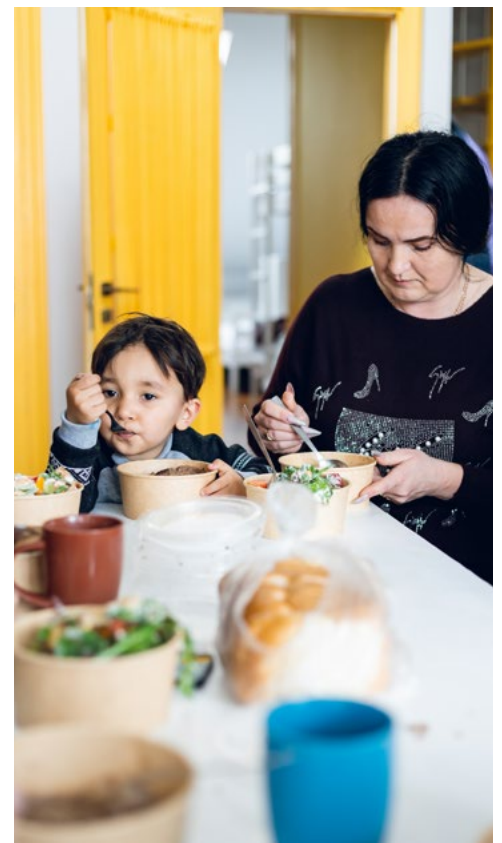
Photo: Children from Bahmut, which is the place of the longest and bloodiest battle of war in 2023, currently lives in supported by Alliance shelter in Lviv