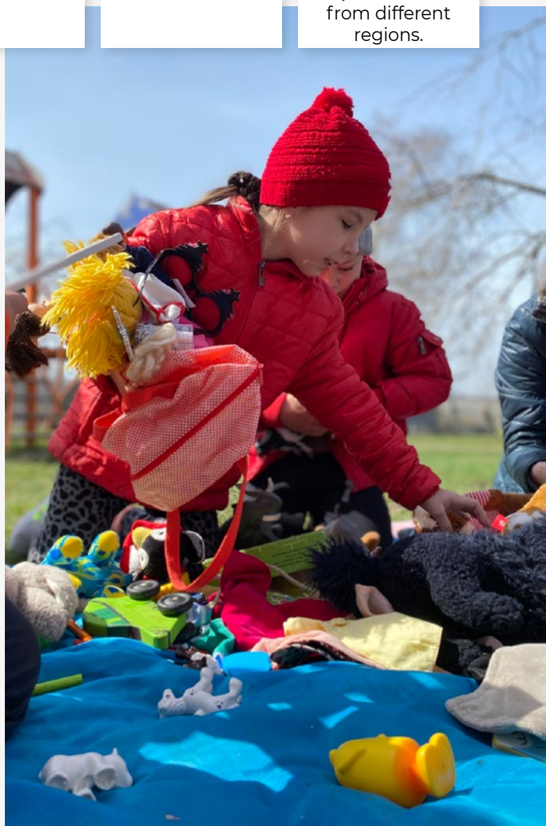
Photo: children receive humanitarian assistance in de-occupied territory of Kherson region

The activity is implemented with the financial support of the Disasters Emergency Committee (DEC) (United Kingdom) and the coordinating and technical support of the charity organization Christian Aid (United Kingdom).