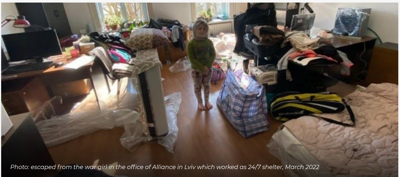
Photo: escaped from the war girl in the office of Alliance in Lviv which worked as 24/7 shelter, March 2022